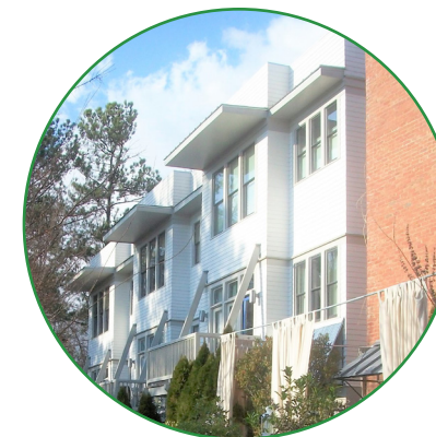
Diverse housing types, front landscaping