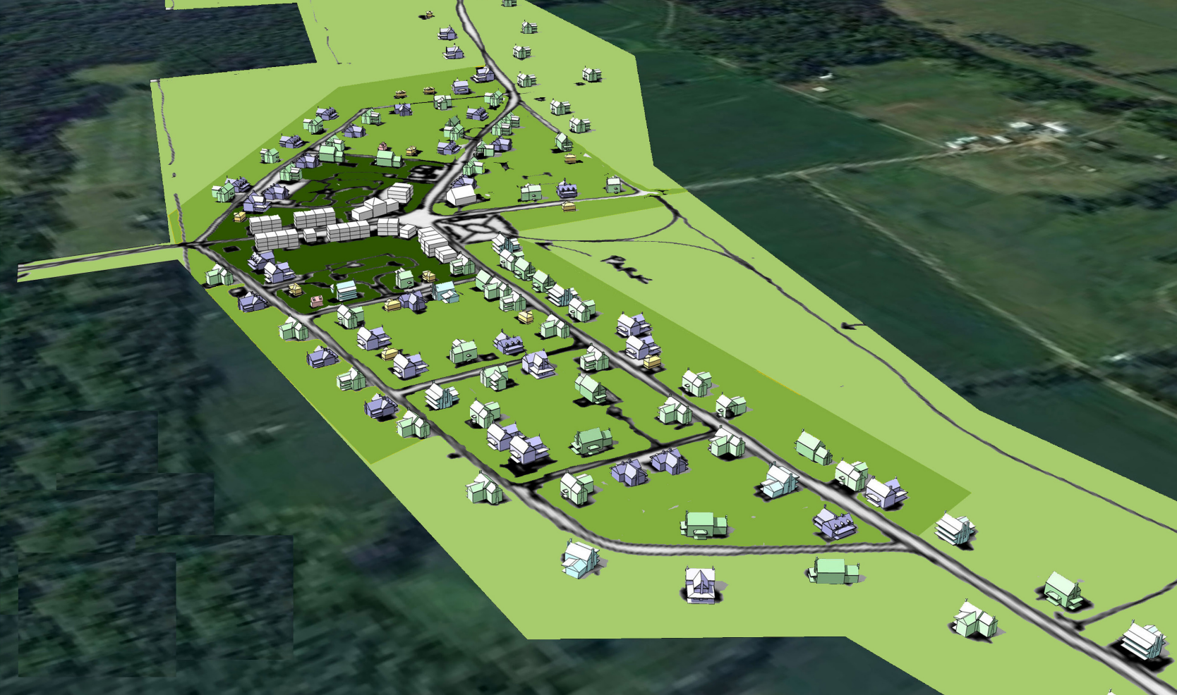
Above: Village plan view showing central business and residential core, adjacent residential neighborhood and surrounding areas of conservation.