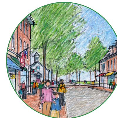
Dense business core, pedestrian activity