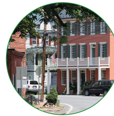
Compact building forms, mixed uses