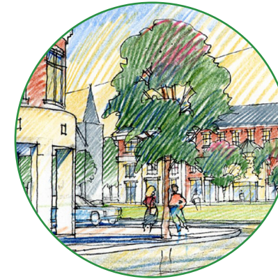
Central green, sidewalks, street trees