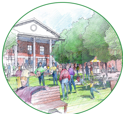
Village green frames public buildings