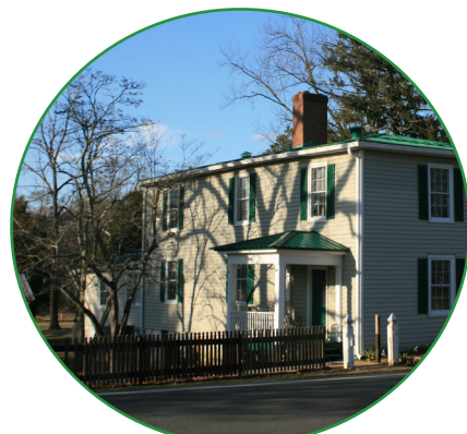
Historic buildings and residential uses