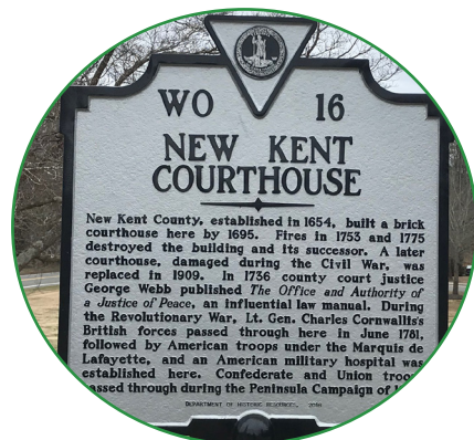
Interpretation of historic places