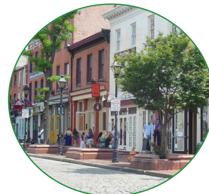
Dense mixed-use commercial center