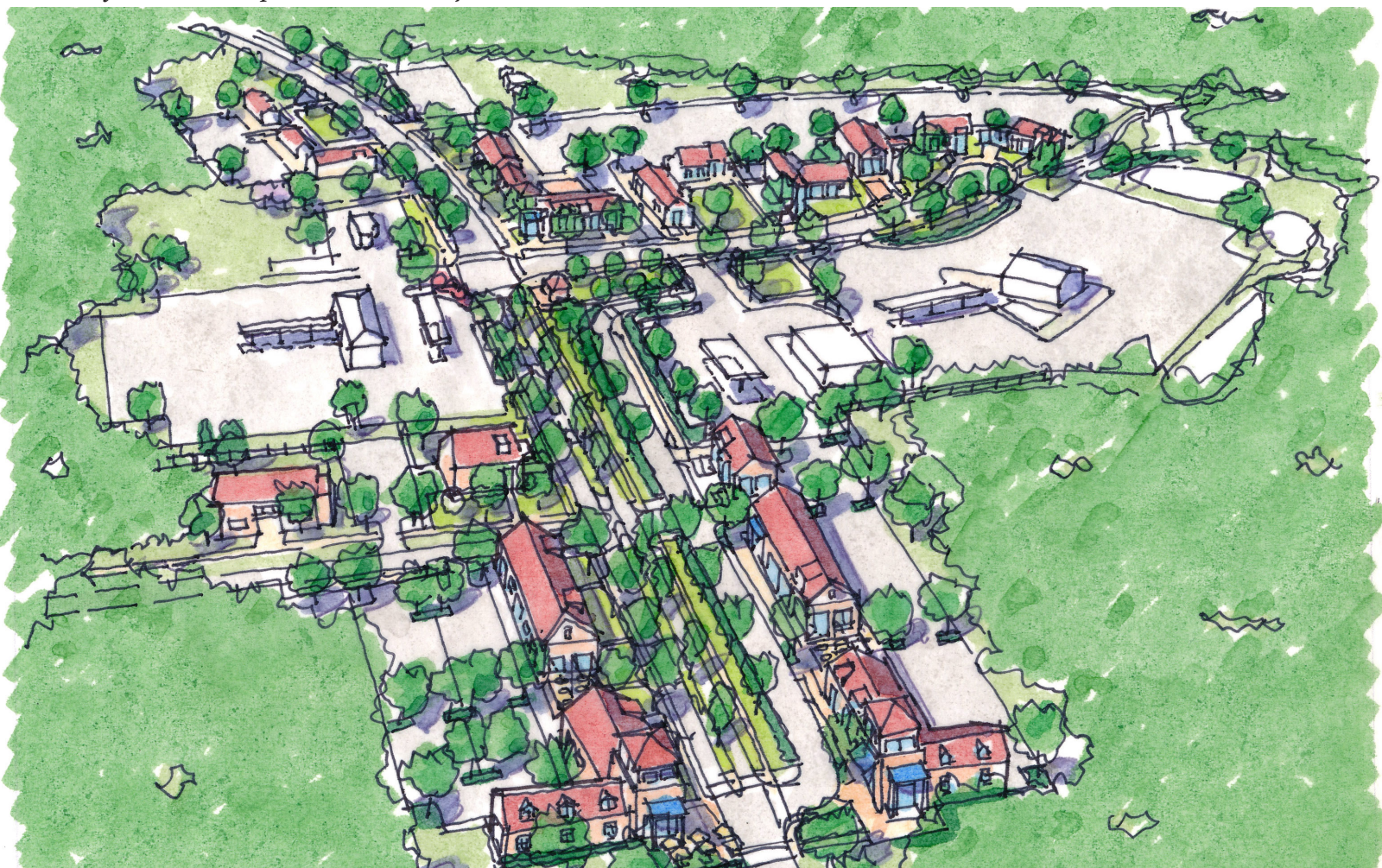
Left: Perspective view of Interstate Interchange Development looking from the interchange entrance corridor. Note the dense business building pattern and landscaped building frontages and entrance roads.