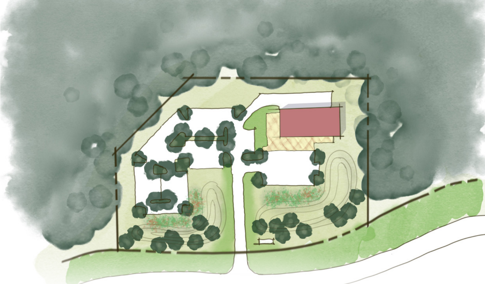
Above: Plan view of Business Park Development parcel showing landscaped corridor entrance road and setback, building sited within the landscape, and parking/service carefully placed to minimize visibility from the public road.