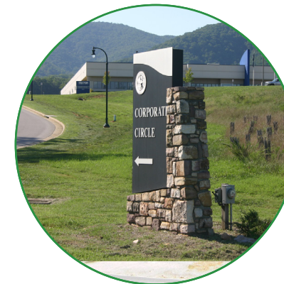
Design guidelines to coordinate signage, building setbacks, parking, and amenities

Early site planning for business parks can provide a strong foundation for incorporating natural features, providing appealing entrance approaches, establishing architectural and site development standards, and ensuring an appropriate business mix.