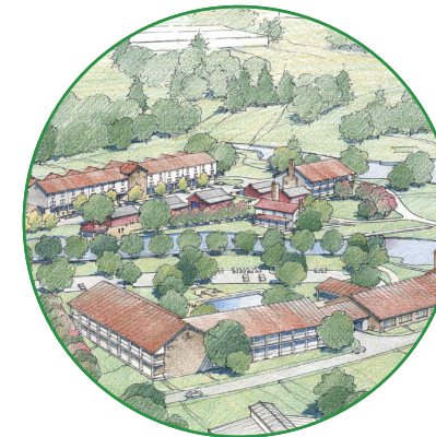
Central amenity center for daycare, convenience retail and services