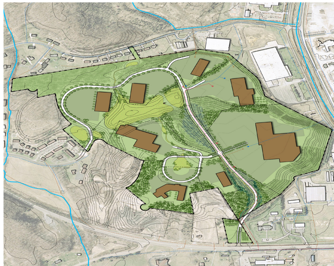
Left: Plan view of a Business Park showing development footprints (for buildings and parking) that are carefully sited in the landscape. Development takes advantage of a green parkway entrance corridor, natural environmental features, and an incorporated trail system.