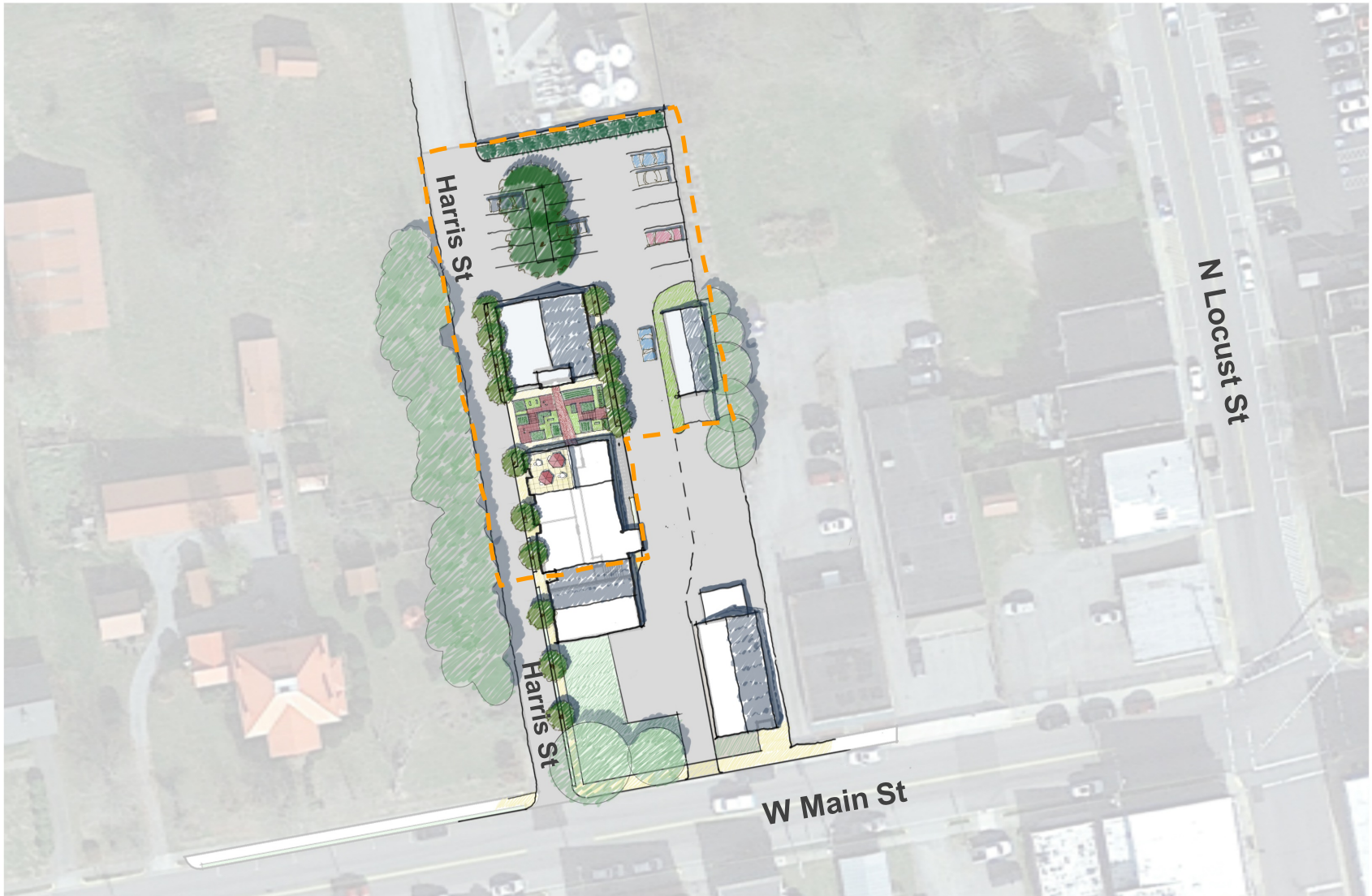
Site Concept A (relocating existing easement)